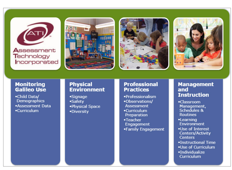
Four primary areas available in the Assessment and Curriculum Fidelity Tool to monitor with the option of customizing to meet each program's individual mission and needs

Assessment and Curriculum Fidelity Tool is divided into four focus areas with implementation components. These components offer guiding questions for administrators monitoring implementation. Each implementation component includes a Specific Examples/Notes section for documenting evidence, data sources, and special comments and notes.