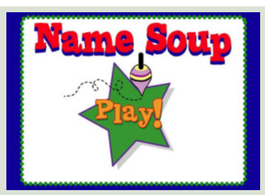
Storyteller instructional activities

Fundamentals of Galileo®: Reports Manual